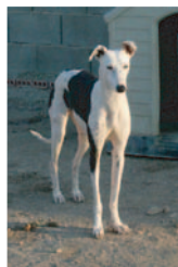
Left: One of the eight Galgos rescued from a well in January 2005.

The even less fortunate get killed on the roads or shot to death. Many others are thrown into wells, burned, drowned or traditionally hanged – the hanging of the Galgos continues in Spain in spite of the many campaigns. It is estimated that more than 30,000 Galgos are killed every year.